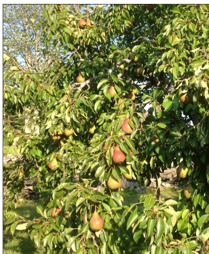
Figure 2. A tree of Clapp's Favorite in a home orchard, loaded with fruit at harvest time.

Pear trees will do reasonably well in a wide range of soil types, although they will not tolerate poorly drained soils with a high water table. Pear trees require full sunlight all day long.