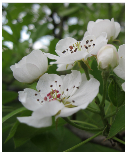
Figure 3. Pear blossoms, ready for pollination.