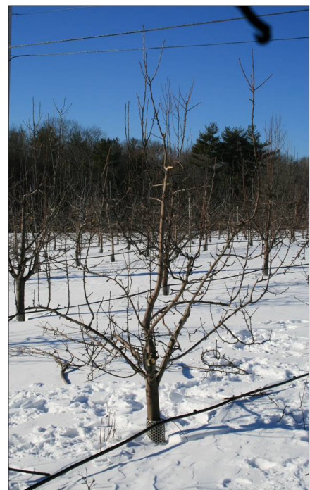
Figure 5. Pear tree after pruning. Excess limbs, over-sized limbs and water sprouts were removed.