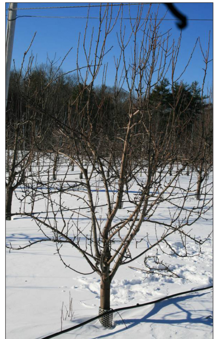
Figure 4. Pear tree before pruning.

Because of their susceptibility to fire blight, pear trees are pruned less severely than apple trees. Pruning is often limited to removing suckers and those branches that are excessively large compared to its neighbors. It may be necessary to do some thinning out of smaller branches to allow better light and spray penetration and to improve size and color of the fruit. The best course of action is almost always to remove a problem branch entirely. The optimum height of a mature standard pear tree is between 15 and 18 feet. This height can be maintained by cutting the central leader back to a weaker, up-right growing side branch every 2 or 3 years.