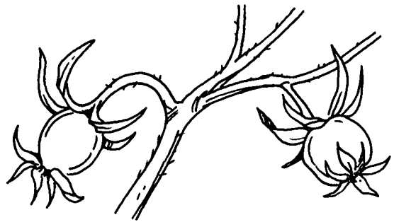
A tomato grows in the flower.