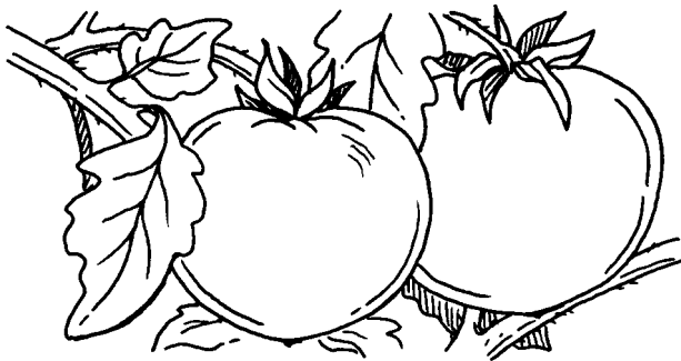
It gets bigger and turns red.