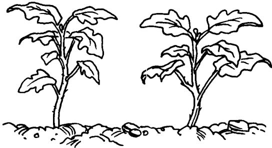
The seedlings get bigger.