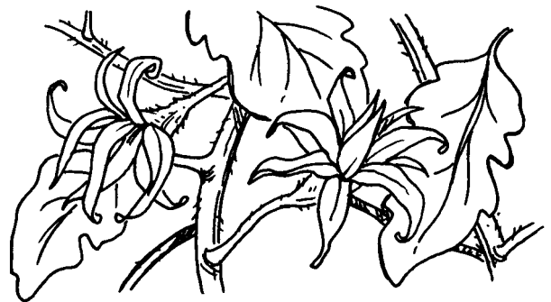
Flowers grow on the plants.