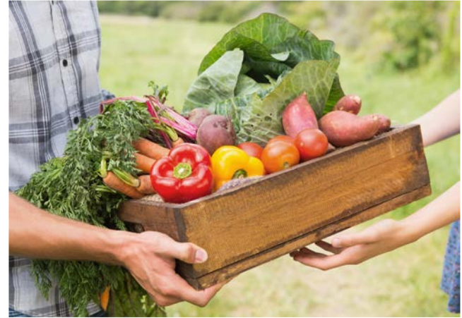
CSAs of Farm to School Produce