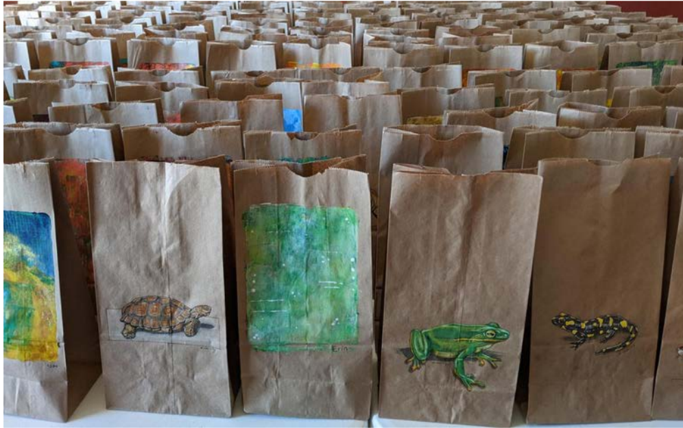
Kits for Kids