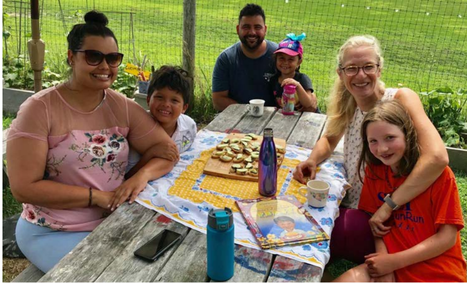
Family Days in The Garden (with Social Distancing)