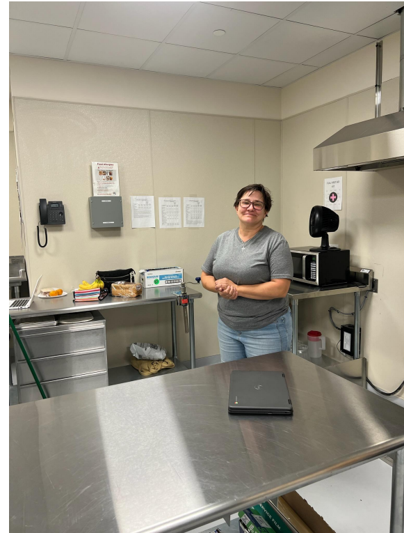
The Guild of St. Agnes in Worcester utilized MA FRESH funds to equip their new early education center with kitchen equipment.