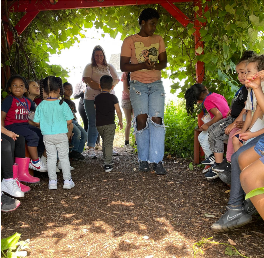
Rainbow Child Development Center utilized MA FRESH funds to support field trips to the Worcester REC farm this spring.