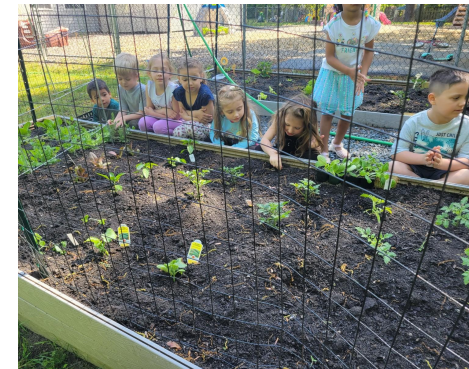
Assonet (Children’s Development Center), built a new garden for outdoor learning with MA FRESH funds.