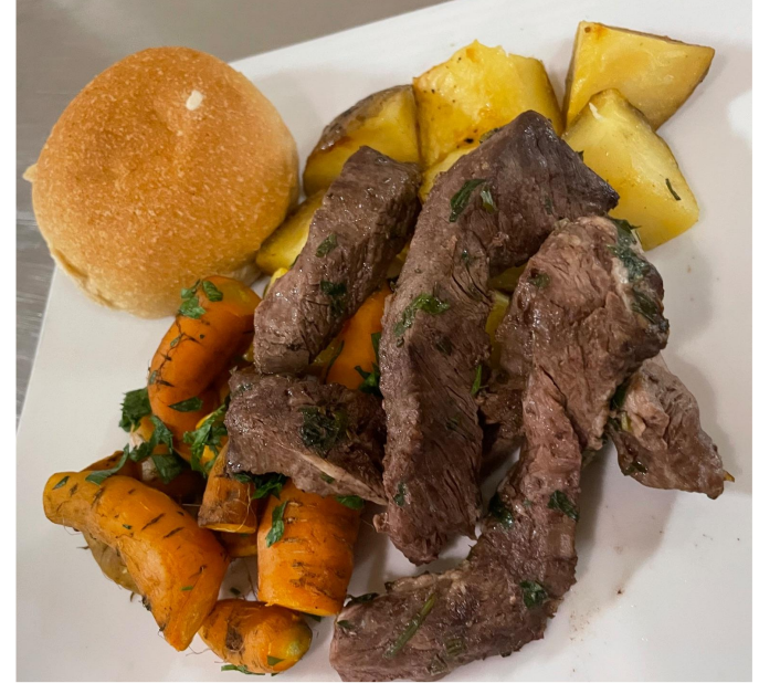
Local beef strips served in Franklin Public Schools in September.

References: Franklin Public Schools went through an Invitation for Bid (IFB) for beef and pork products, focusing on local vendors who could verify animals raised on local farms.