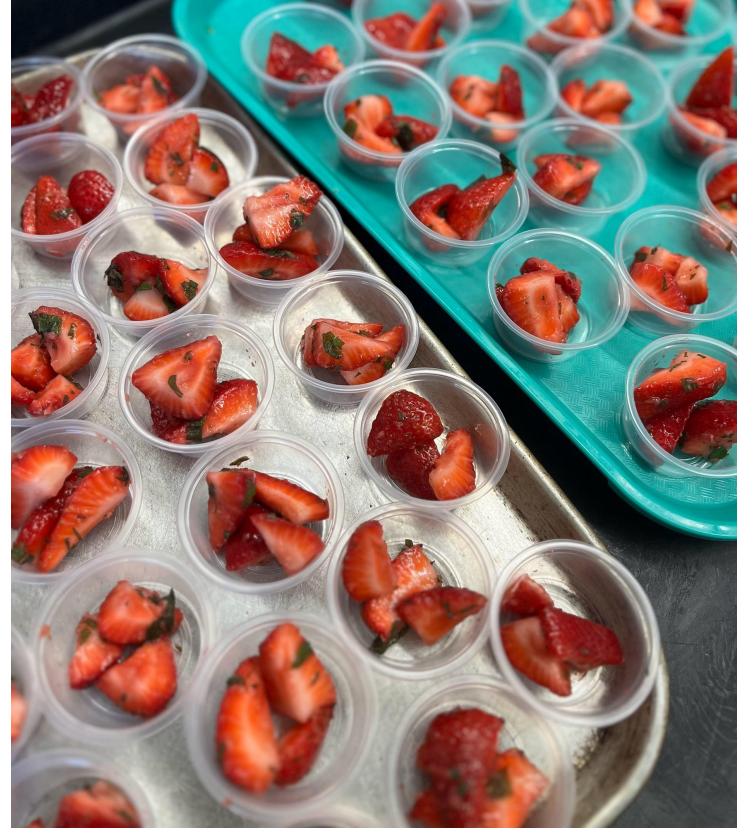
Hatfield Public Schools sampling strawberries for June's Harvest of the Month