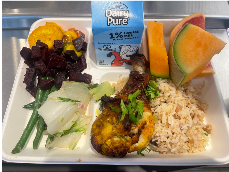
Tandoori chicken served at Belmont Public Schools

Appropriate procurement method is determined by maximum award threshold: under or over $100K within 1 fiscal year (July 1-June 30)